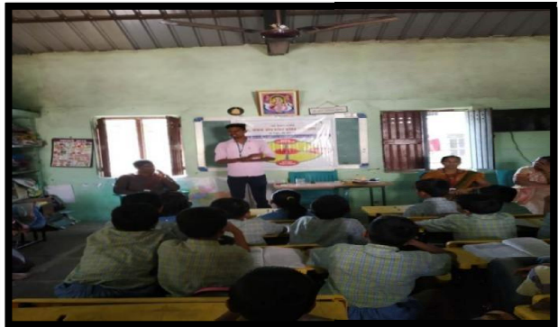
B.Sc. III Physics Student explaining Science behind experiments to Z. P. School Students