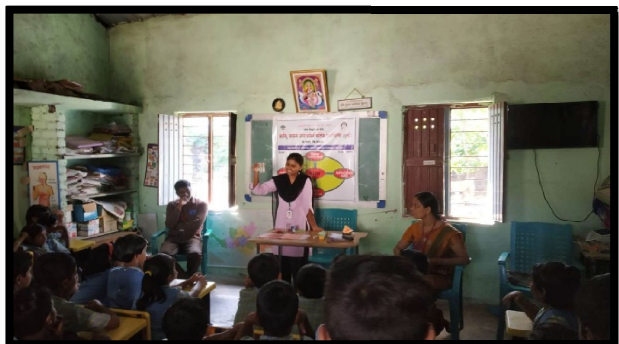
B.Sc. III Students demonstrating experiments under KIDS activity