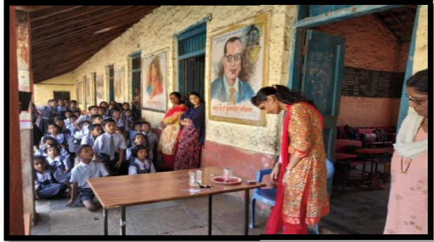
B.Sc. III Students demonstrating experiments under KIDS activity