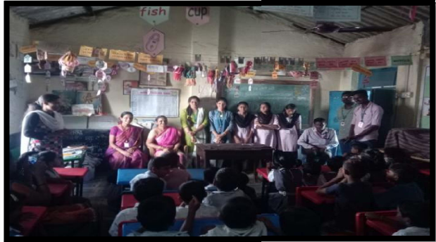
B.Sc. III Physics Student participation in KIDS activity.